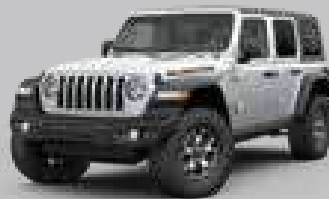
Zynith Silver** Metallic