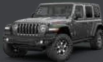
Granite Crystal Metallic