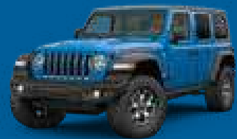
Hydro Blue Pearl